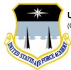
U.S. Air Force Academy (Colorado Springs, CO)