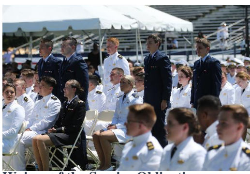
Waiver of the Service Obligation The Federal Government realizes that there may be situations that prevent graduates from fulfilling the requirements of the service obligation contract. Waivers may be granted in cases where there would be undue hardship in the performance of satisfactory maritime service or when it is impossible to perform satisfactory maritime service due to an accident, illness or other justifiable reason as determined by the Maritime Administrator.

The foregoing list does not set forth all types of positions, organizations, or fields that may be acceptable to satisfy the service obligation.